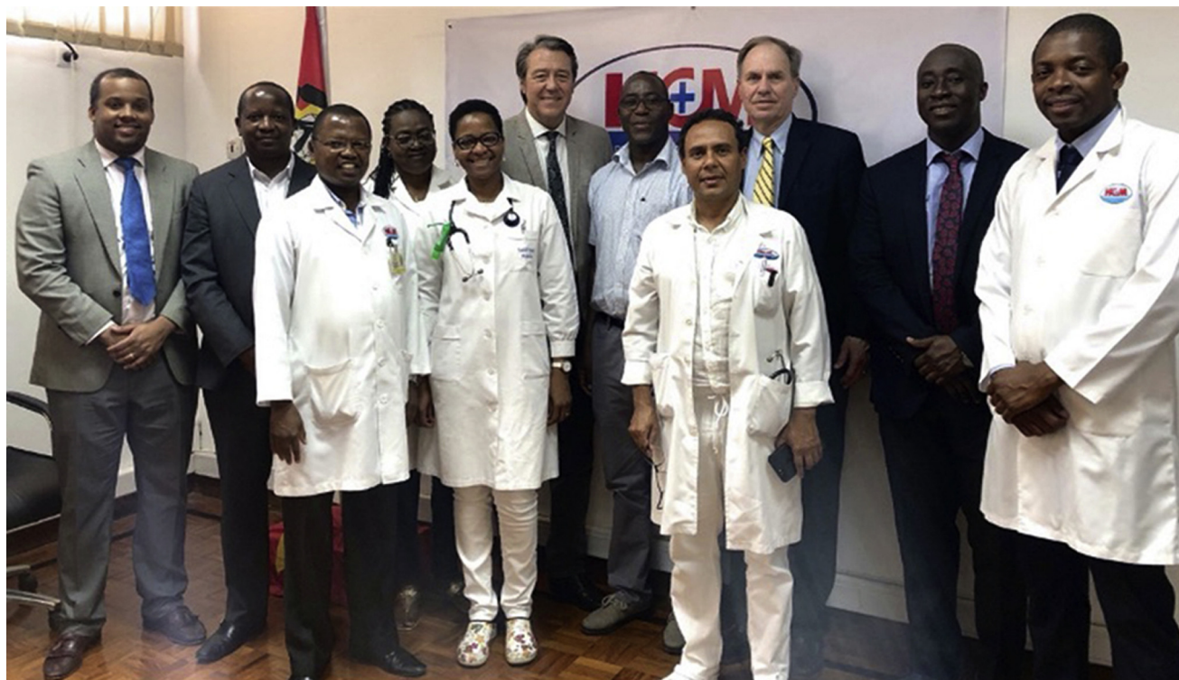
FIGURE 2. Cardiac Surgery Intersociety Alliance meeting with the cardiac surgery team and the Minister of Health—Mozambique.

note, we were screened at each airport we visited with temperature measurement or a travel and symptom questionnaire. With the ongoing suspension of in-person meetings, CSIA has been unable to publicly announce the final sites selected for endorsement, a necessary step before initiating fund-raising efforts for those sites. That is why the decision was taken to prepare a manuscript detailing the process employed and the outcome of that process, namely, the endorsement of the two sites listed in this publication.